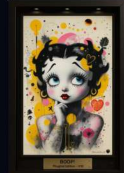
BOOP! - Phygital Edition