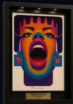
POP VOCAL - Phygital Edition