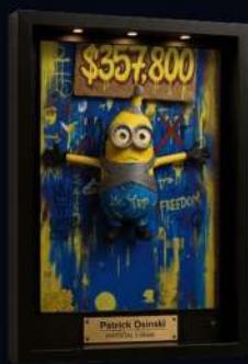
BANANA - Phygital Edition