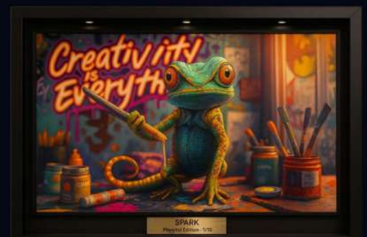
SPARK - Phygital Edition