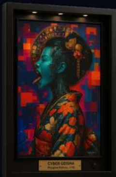
CYBER GEISHA - Phygital Edition

I do not sell just paintings. I sell portals. I sell discoveries.