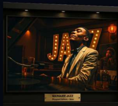
MARQUEE JAZZ - Phygital Edition